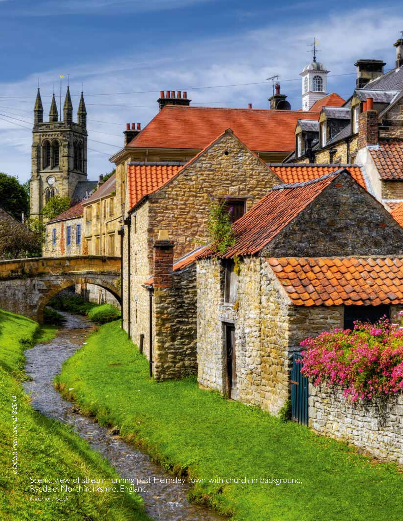
Scenic view of stream running past Helmsley town with church in background, Ryedale, North Yorkshire, England.