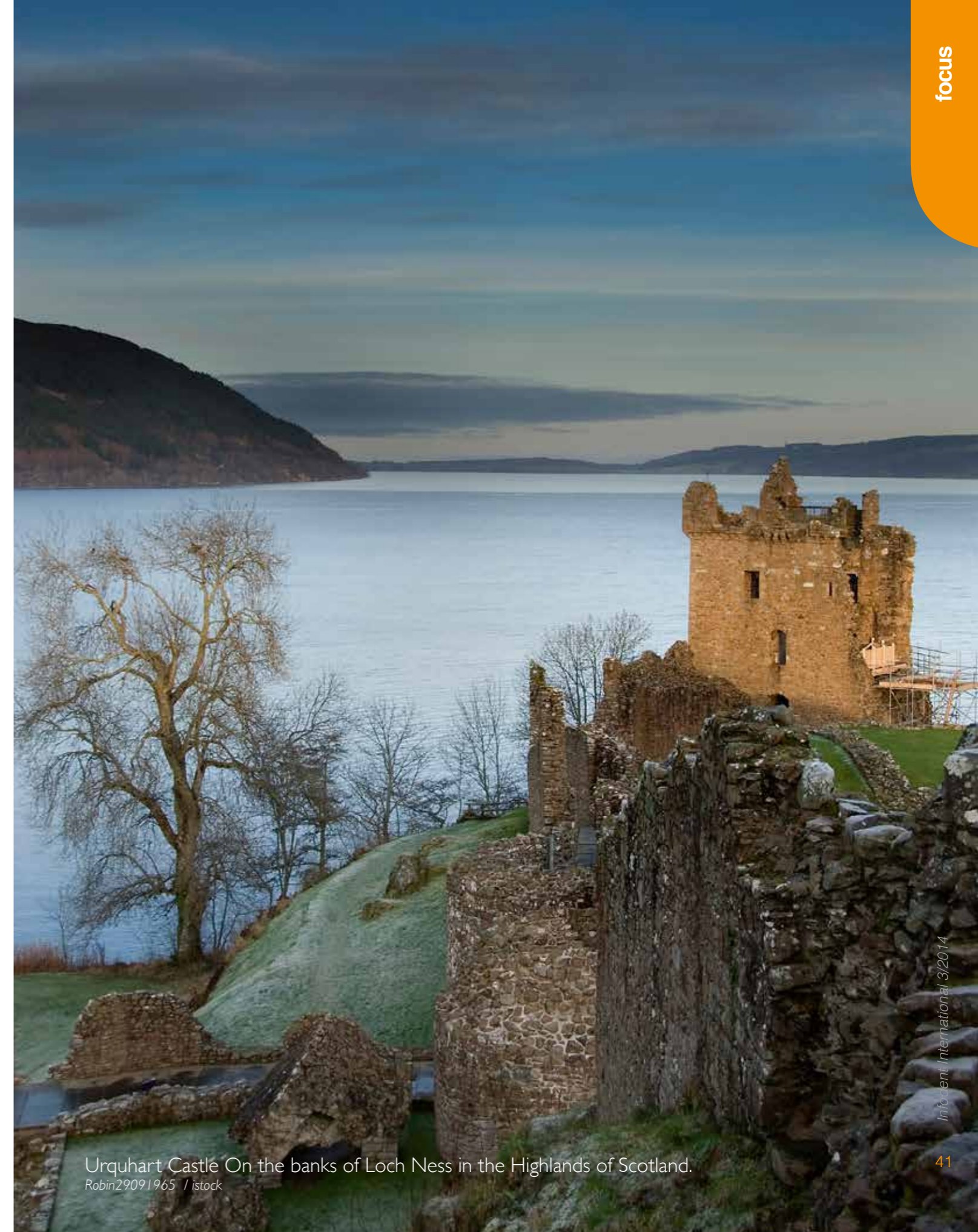
Urquhart Castle On the banks of Loch Ness in the Highlands of Scotland.

The Salaried Primary Dental Care Service (SPDCS) provides public oral healthcare to disadvantaged groups with limited access to other dental services. General hospitals and dental teaching hospitals also provide dental treatments, in particular specialist care upon referral.